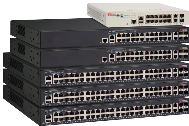
Figure 1. Brocade ICX 7150 Switch models.

Brocade Ethernet switch stacking 2 technology makes it possible to stack up to eight Brocade ICX 7150 switches into a single logical switch. This allows the Brocade ICX 7150 to deliver a class-leading 320 Gbps of aggregated stacking bandwidth and offer simple and robust expandability for future growth at the network edge. This stacked switch simplifies management with only a single IP address and offers transparent forwarding across a pool of up to 400×1 GbE ports and 32×10 GbE ports. When new switches join the stack, they automatically inherit the stack's existing configuration file, enabling true plug-and-play network expansion. Flexible licensing of 1 GbE to 10 GbE ports for uplink and stacking allows organizations to optimize network performance based on specific requirements. Brocade stacking technology also delivers high availability, enabling instantaneous hitless failover to a standby stack controller if the master stack controller fails. In addition, organizations can use hot-insertion and removal of stack members to avoid interrupting network services.