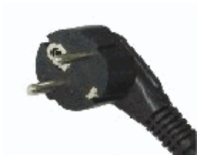
DIN49441 16A plug