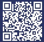
RUTX09 360° VIEW